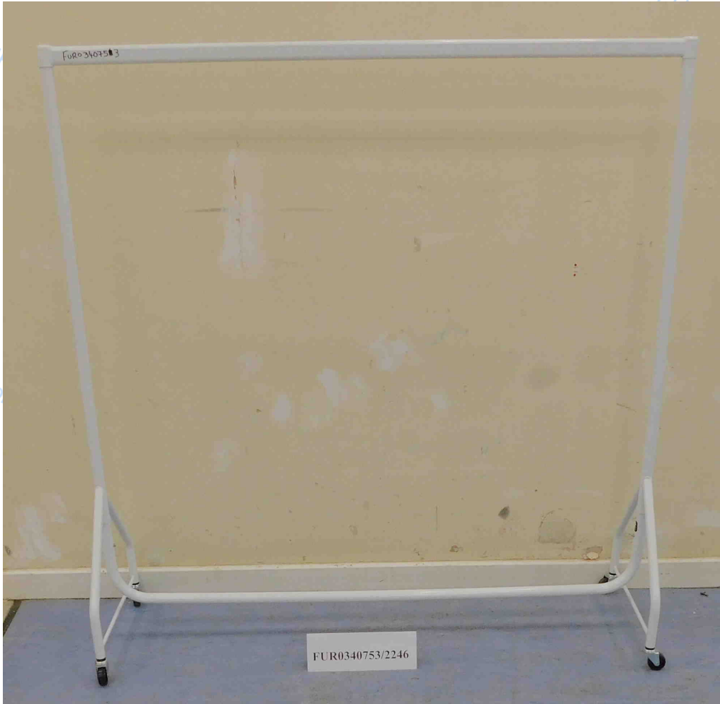
Picture 1: Front view of the '44416 – White Heavy Duty Clothes Rails – L 5ft x H 5ft'