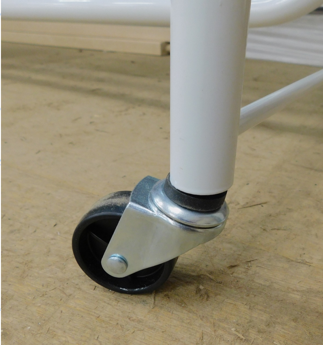
Picture 3: Slight Deformation of Castor at 200kg load of the '44416 – White Heavy Duty Clothes Rails – L 5ft x H 5ft'